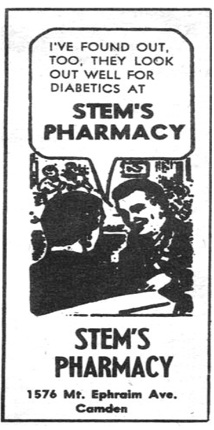
Camden County Record 1976