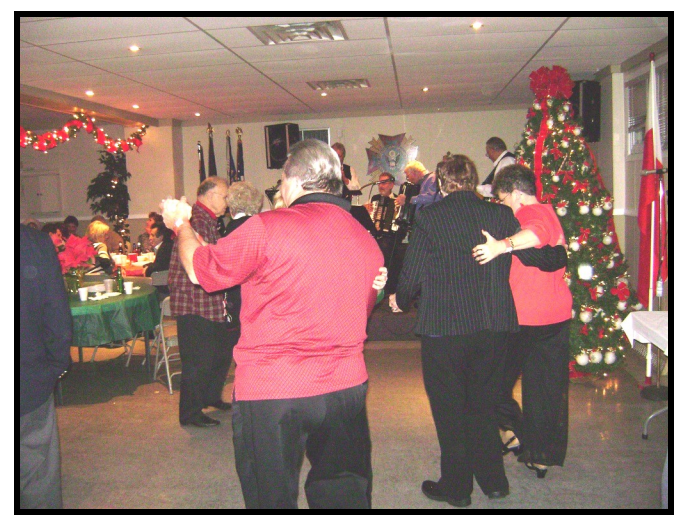
A Great time was had by all who attended The music, food and drink were excellent.

These and more Photos are on our website at: http://www.pacc1914.org